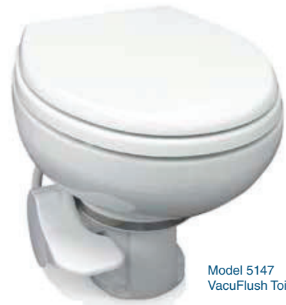
Model 5147 VacuFlush Toilet

Specifications subject to change without notice.