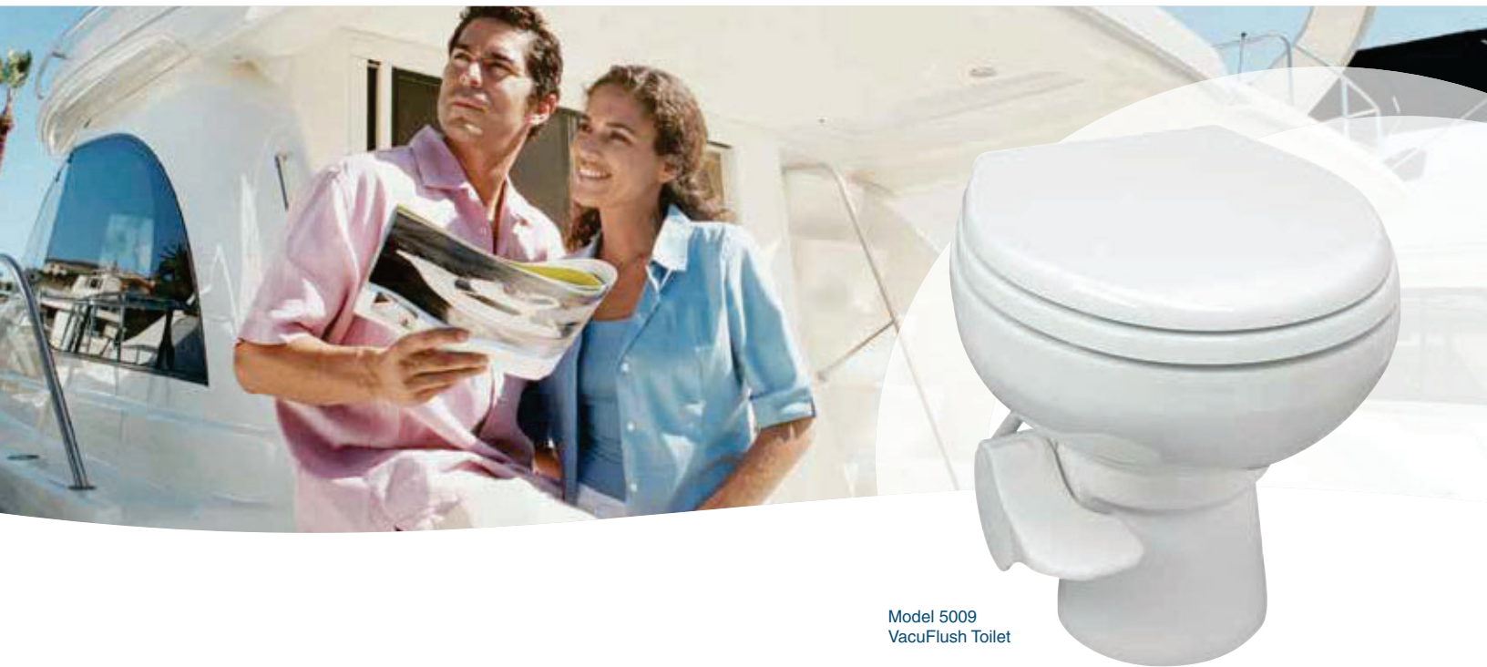
Model 5009 VacuFlush Toilet

Compact Design. Powerful, Efficient Flush.